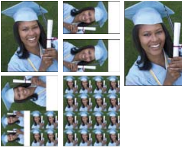
8"x10", 8"x12", multi cut, package prints

With widely available software packages, the CHC-SI245 prints borderless 8"x10", 8"x12" or package prints.* Multi-cut capable, prints are cut to 8x10, 8x12, two 5x7/8's, two 6x8's, or three 4x8's.